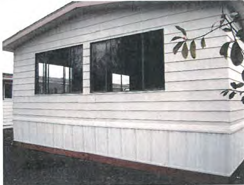
SIDE VIEW - LOOKING AT WEST SIDE OF BUILDING - Photo Taken 03-04-2014